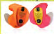
CENS ProFlex Digital Custom

Evolution in gunshot hearing protection continues with the CENS® electronic modules. Combined with unique multi-softness custom fit earpieces or our Insta-Mold on the spot material. This new unique design combines superb functionality with an eye catching appearance and this latest development leads the trend towards comfortable custom noise suppression for today's shooter.